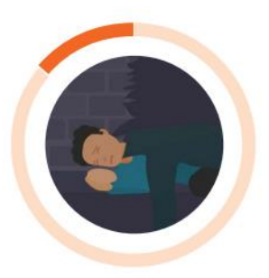
14 per cent of care leavers have slept rough